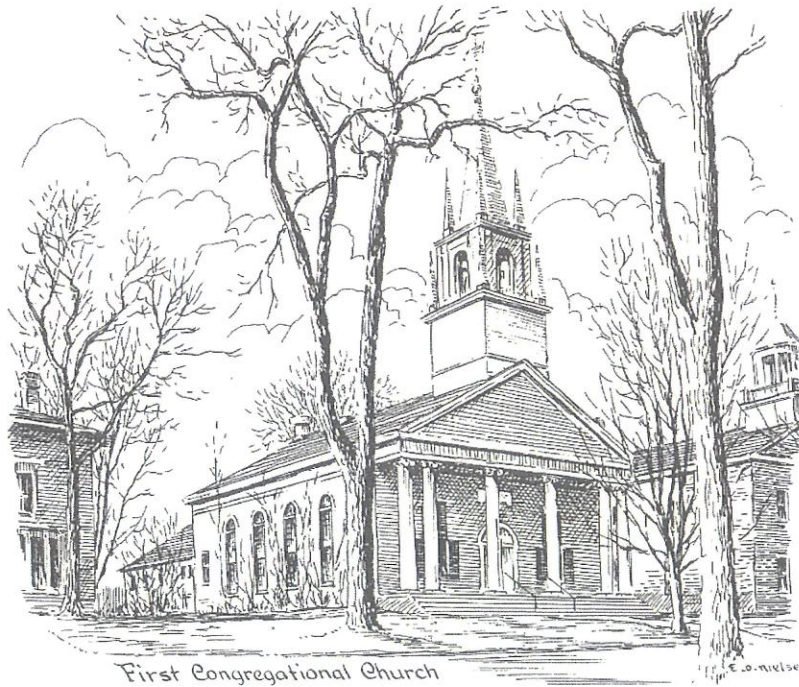
First Congregational Church